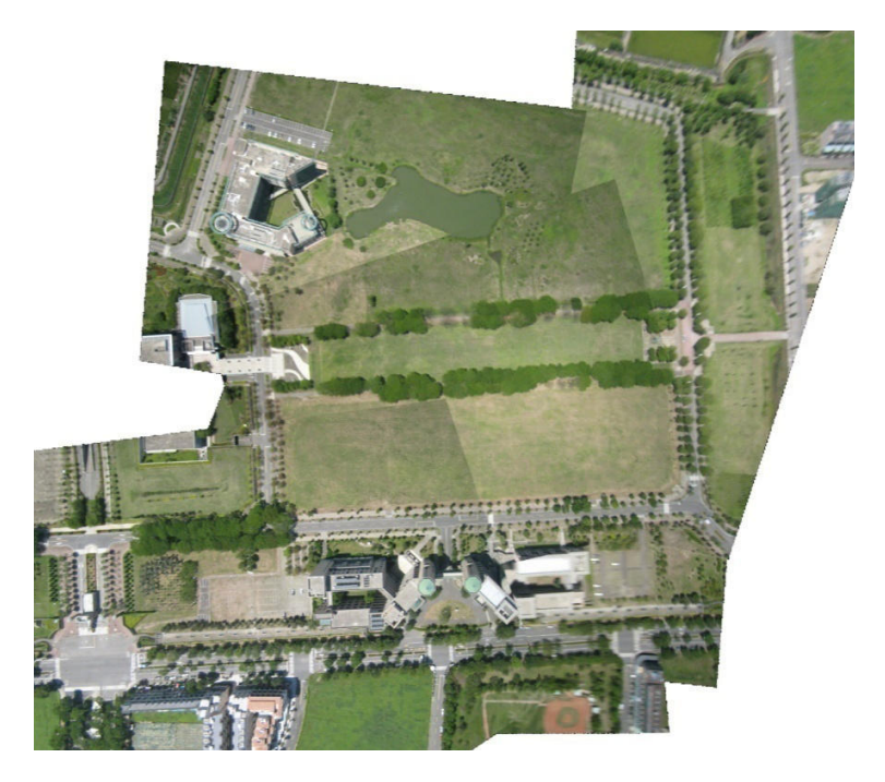
Fig. 4: The corrected, edited and mapinterlinking photo from camera installed in UAV

identify with known geographic coordinates information and also these aerial photographs can be placed in the correct position on the coordinates to correct the deformation cause by UAV vehicle is tilting when the moment of capture original image. This corrected, edited and mapinterlinking photo, detected from DIC camera, is shown in Fig. 4.