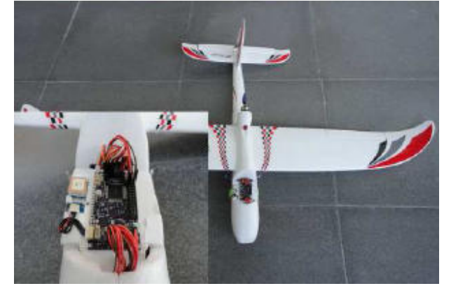
Fig. 1: the prototype of this developed UAV based on these three open sources