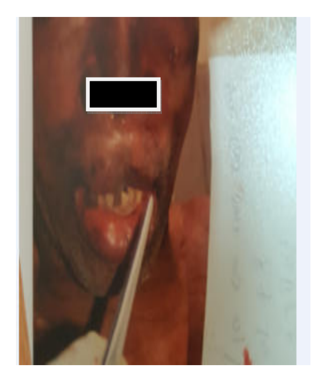
Figure 1: Depicts: swelling upper and lower lips with multiple areas of haematoma.