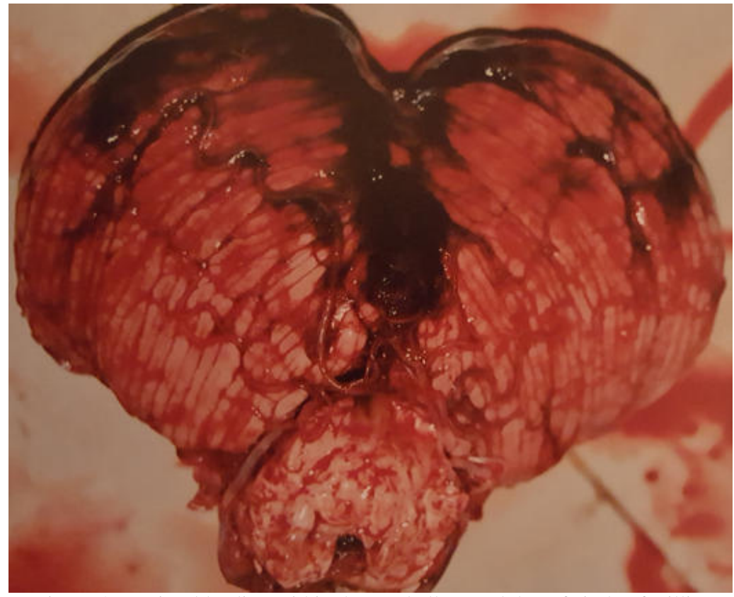
Figure 4: Depicts bleeding within the cerebellum and that of circle of willis.