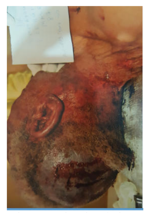
Figure:2 (Depicts Linear bruises)